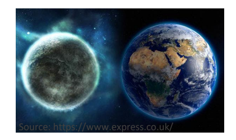
Human-habitable planet beyond the galaxy