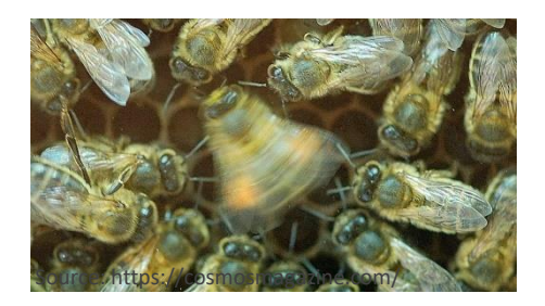
How bees communicate (discovered)

To claim what we have discovered, the methodology must be <u>academically acceptable</u>.