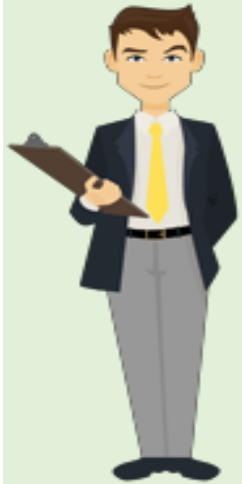
The Inspector ISTJ

Common Personality Traits for the inspector