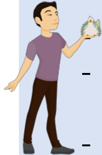
The Idealist INFP

Common Personality Traits for the Idealist