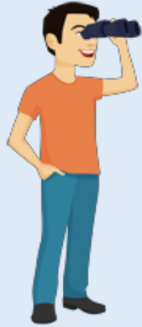
The Visionary ENTP

ENTP: Extroverted, Intuitive, Thinking, Perceiving