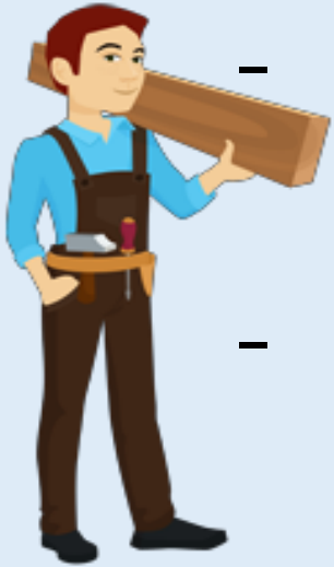
The Craftsman ISTP