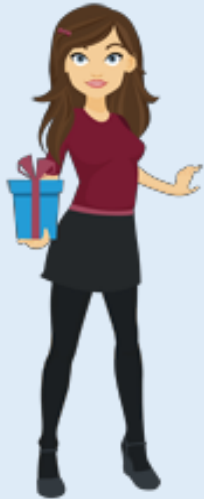
The Giver ENFJ