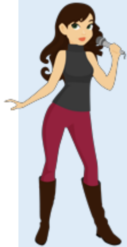
The Performer ESFP

Read More: https://www.personalityperfect.com/16-personality-types/