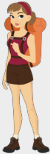
The Doer ESTP