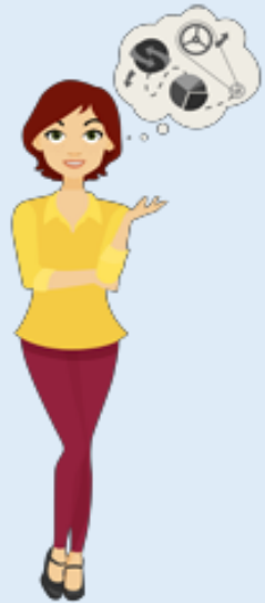
The Thinker INTP

Common Personality Traits for the Thinker