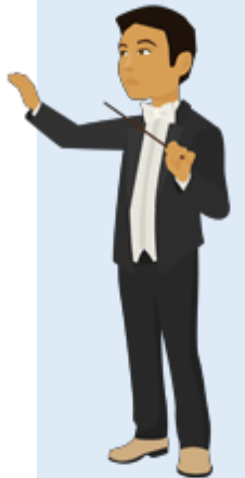
The Commander ENTJ