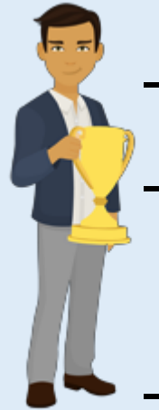
The Champion ENFP