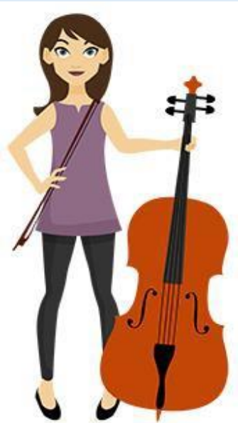
The Composer ISFP

Read More: https://www.personalityperfect.com/16-personality-types/