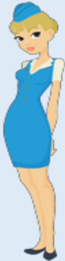
The Provider ESFJ